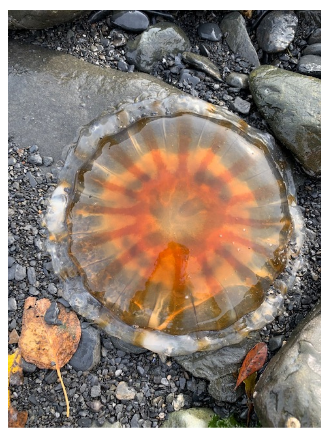
Spring Intensives 2020 Polaris K-12 School